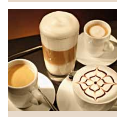
Wide range of specialities